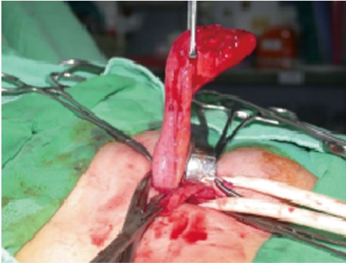
Figure 3 The appendix was found to adhere to the inner surface of the hernia sac in the operation.