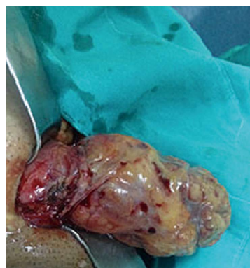
Figure 2 Pathological view for acute gangrenous appendicitis.

cases. Consensus has yet to be reached regarding the risk involved in herniorrhaphy with prosthetic material subsequent to the resection of the inflamed appendix and regarding the necessity of resecting an uninfamed appendix. Due to the rarity of this condition, management of Amyand's hernia varies amongst different clinicians and can even vary for the same clinician over time. The presence of an inflamed appendix vermiformis in the sac of an inguinal hernia is referred to as Amyand's hernia. The condition was first described by an English surgeon named Claudius Amyand in an 11-year-old male patient after finding a perforated appendix in the sac of the inguinal hernia. The disorder has since carried Amyand's name. The incidence of the presence of an uninfamed appendix vermiformis in the sac of an inguinal hernia is estimated to be 0.13%, but it is even rarer to find an inflamed appendix in an inguinal hernia sac [1,2] . Routinely found within the sac of an inguinal are the omentum, small intestine or urinary bladder. Aside from these conditions, Meckel's diverticulum (Littre's hernia), part of the wall of the intestine (Richter's hernia), or inflamed or uninfamed appendix vermiformis (Amyand's hernia) may be included in the sac of an inguinal hernia [3,4] . In this paper, we aim to discuss our cases along with data from current studies.