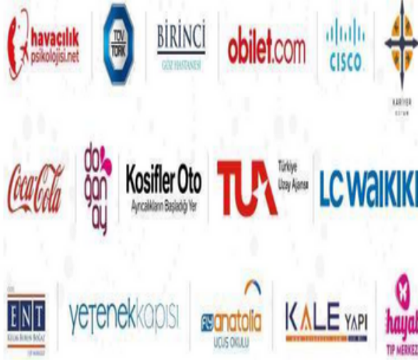
Table 5. Collaborations Established in 2023 in line with Sustainable Development Goals