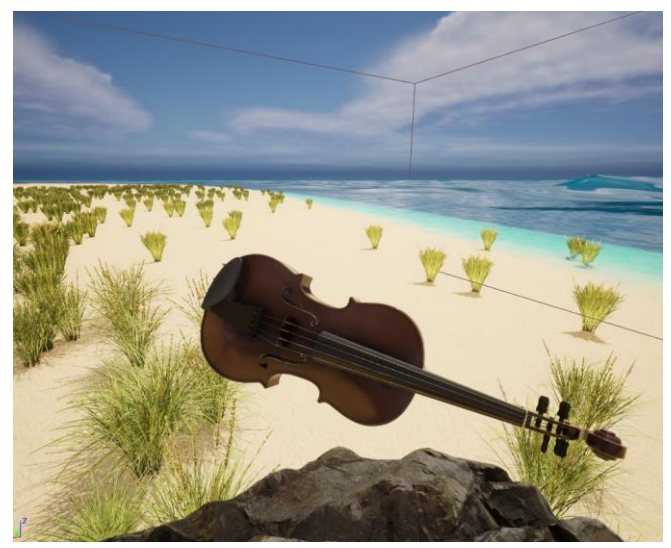
Fig. 6. Seaside location

In this study, some locations are modeled and the student can choose the location where to play the violin. This may be a seaside, concert hall or any other place. The student feels to exist in the place of the virtual environment. This may increase the motivation to learn or play the violin. A view from a seaside location can be seen in Figure 6.