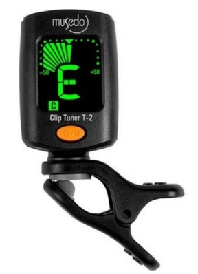
Fig. 7. A view from Gamification

Since the tuning process requires experience, the student may not tune correctly at the beginning. Even if the tuning is done by the trainer, when the student goes home, then the violin will get out of tune again as a nature of the stringed instruments, and if the student cannot tune, this will cause the string to sound disharmoniously. A tuner is usually used for tuning. The strings are loosened or tightened by the pegs. The tuner indicates whether to loosen or tighten the strings and when the target frequency is achieved, it displays it on the screen. In Figure 7, the picture of a tuner is presented. If there is no good tuning, the musical instrument will not sound properly and the student cannot learn correctly or music cannot be made together with other musical instruments in harmony which may cause the student to give up the musical instrument and stop learning it. One of the real-life problems is that when a student goes home after the class, the student may be unsure of the accuracy of playing, during practicing or doing homework