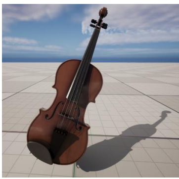
Fig. 1. Image of a modeled violin

In this study, firstly, violins and accessories used in the virtual reality environment have been modeled by means of three-dimensional design programs. Software such as Blender, 3d Studio Max, Autodesk Maya can be given as examples of three-dimensional design and animation programs [12]–[14].