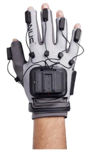
Fig. 3. Haptic feedback gloves

As a sensing element, the built-in camera of the Oculus Quest 2 or the haptic VR gloves seen in Figure 3 are used to detect the user's finger pressing and bow pull and push in this application.