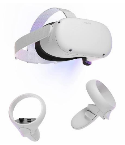
Fig. 2. Oculus Quest2 Virtual Reality Glasses

Although most of the virtual reality applications consist of games, applications of education and different sectors are also frequently encountered [15]. Virtual reality has its own rules and it doesn't have to be the same as reality. Thanks to the virtual reality glasses, the user of the glasses immerses into virtual environment [16]. By means of the controllers used with the virtual reality glasses interaction can be added to the game or application. These controllers have the ability of operations such as holding, firing and pressing. Some of the virtual reality glasses used today can be listed as Oculus Quest 2, HTC Vive, HP Reverb G2 and Samsung SM-R323. In this study, Oculus Quest 2 virtual reality glasses have been used to see the modeled violin and accessories in a virtual reality environment. The virtual reality glasses used in the study can be seen in Figure 2.