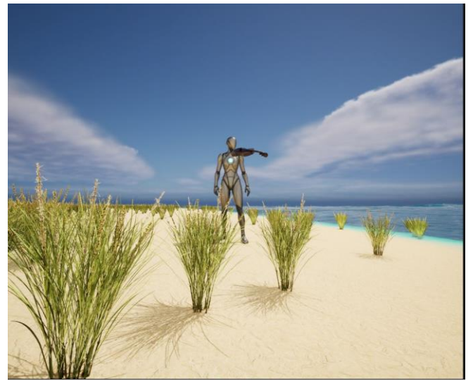
Fig. 5. A view from Gamification

student. In order to ensure the digitalization of higher education in Turkey, the "YÖK (Council of Higher Education) Digitizing" project was implemented. The Ministry of National Education of the Republic of Türkiye is also switching from traditional systems to digital methods. Therefore, the usage area of gamification is expanding [23]. A view from gamification of the simulation made in the study can be seen in Figure 5.