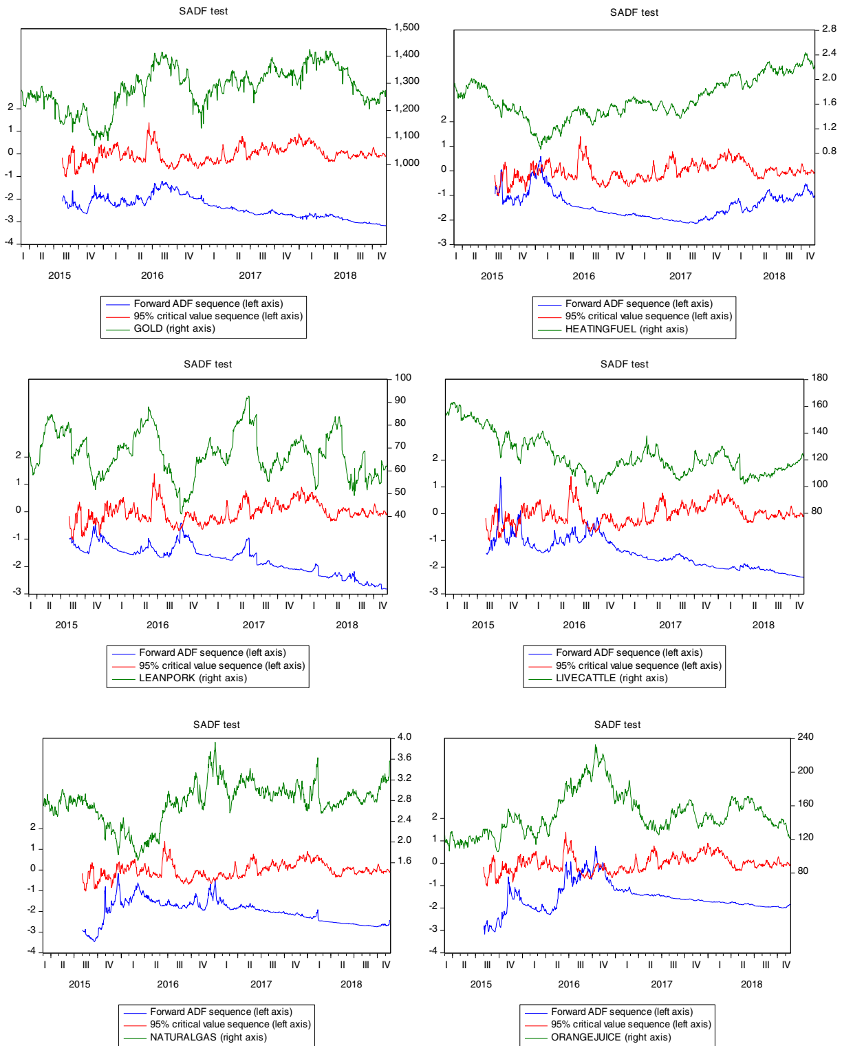
FIGURE A1 (Continued)