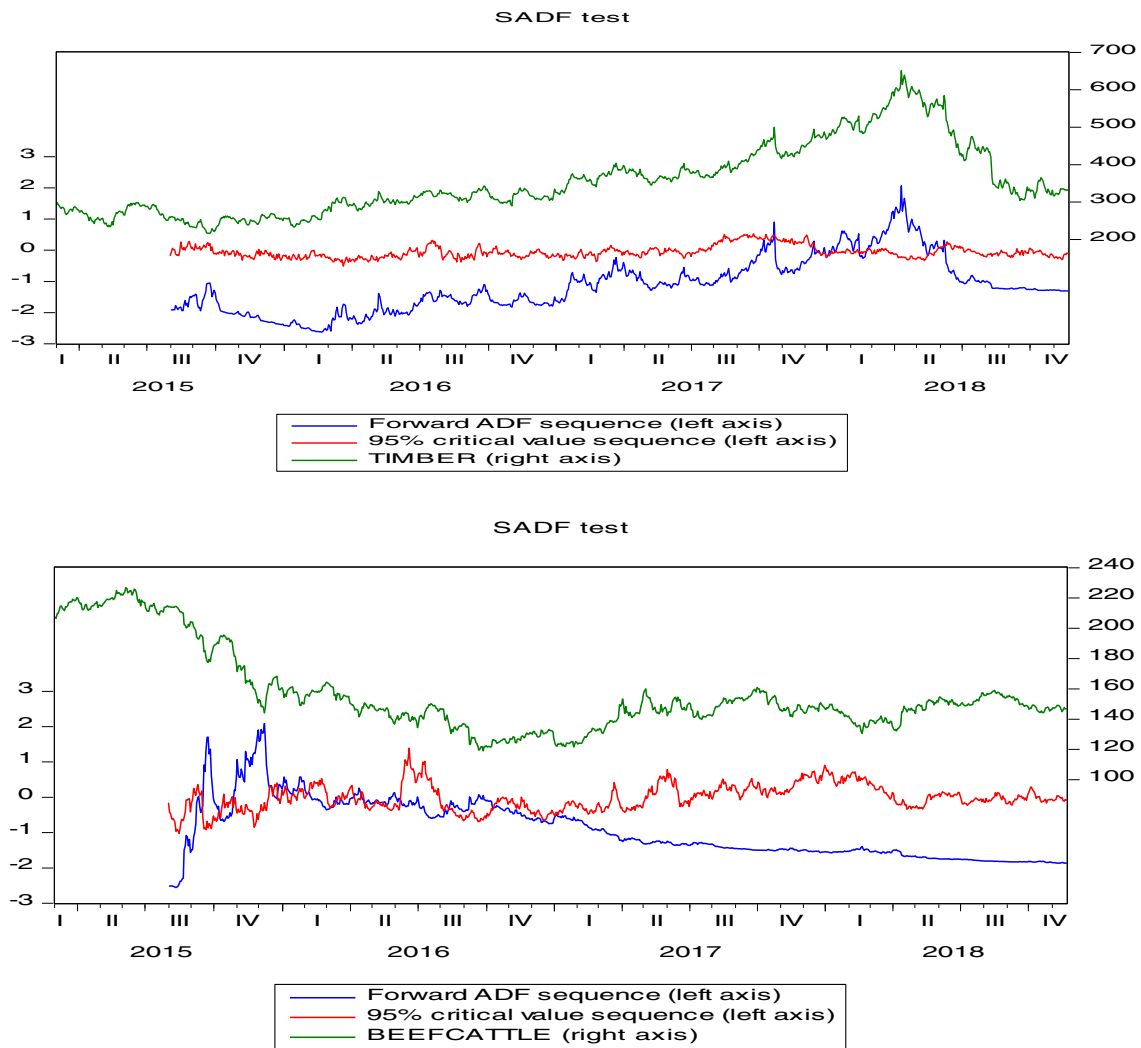
FIGURE 1 Timber and beef cattle prices SADF test result graph. SADF, sup augmented Dickey–Fuller