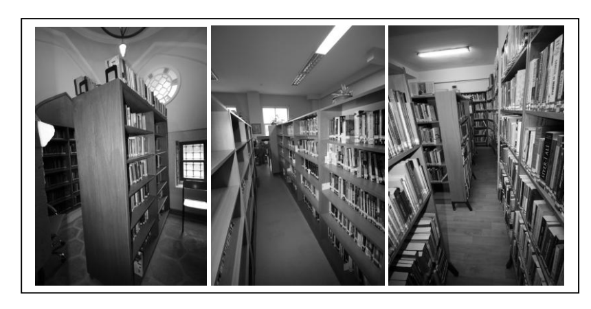
Figure 6. Bookshelves Arrangement the bookshelves should be arranged enough width (Yücel, 2015)

The sufficiency of circulation area in reading and studying halls arranged with shelves should be controlled. The fact that the fixed partials in the structure in the samples in historical structure meet the needs of today's poses a challenge in cases requiring especially wide use areas. Therefore, it is important that special analysis of spatial arrangement and furniture design according to the features of the place in the use of these kind of buildings. Mobile solutions other than the special closed area and desktop computer might provide flexibility in the use of internet. It has been observed that the activity areas are limited in most of the samples. It could be prescribed that it is arranged in the ground floor in multi-storey libraries and it is open to these kind of use by creating flexible use areas inside the library. The location, access and evacuation convenience of the activity area should be considered.