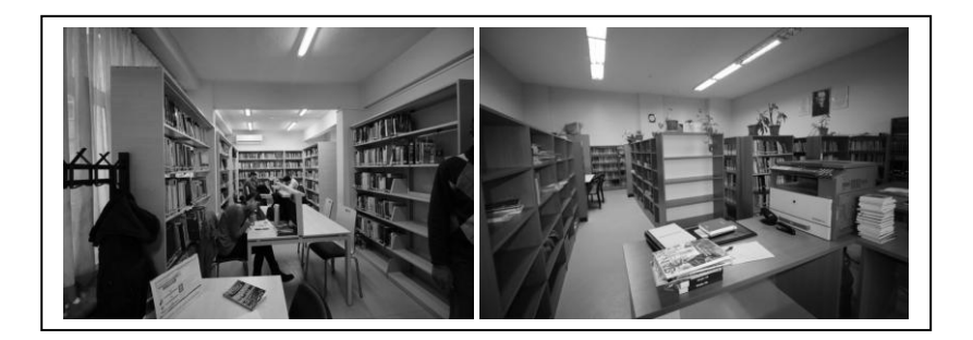
Although book shelves and study tables are in the same hall in some samples, separate grouping has been done. It has been observed that the separation of reading and studying halls is not

Library interior design: In most of the samples, even though the table heights and suitable spaces between tables are considered sufficient in reading and studying areas, the sufficiency of accessibility to reading and studying areas should be preferential. Dense shelve order developed in area insufficiency creates difficulty in use and makes it harder to be in the required standards of the study areas. Book shelves have been solved integrated with reading halls (Figure 4, 5, 6).