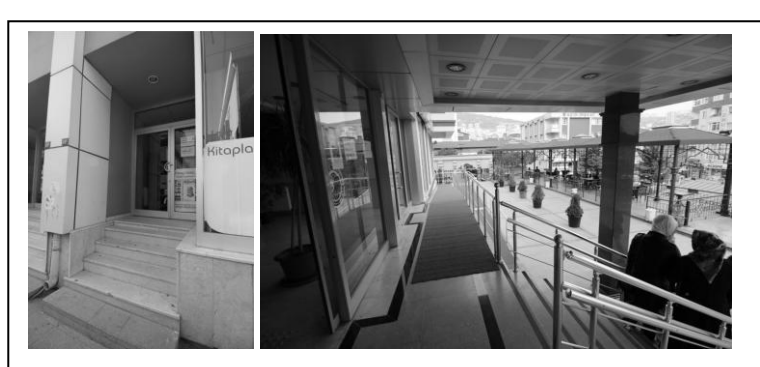
Figure 3. Public Library Entrance Samples (Yücel, 2015)

Building accessibility: The entrance to building, ramp and staircases, building entrance door, horizontal and vertical circulation, book shelves and table regulations in reading halls have been dealt with in the scope of accessible building standards in physical terms in the evaluation. In the samples, there are samples involving the suitable regulation for the disabled access in the entrance of building; also there are samples having difficulties in terms of improving the situation by the place (Figure 3).