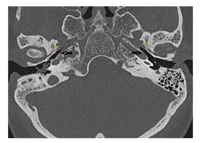
Fig. 2. Right diseased and left healthy ears ET diameter measurement.