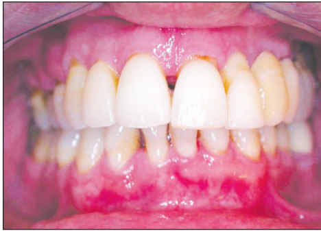
FIGURE 5: Implant retained prosthesis, September 2003.