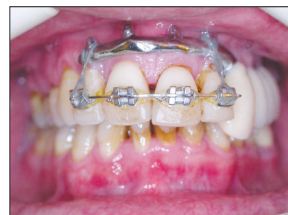
FIGURE 4: Vertical elastic force was applied from the maxillary left lateral incisor to the metal extension of the implant-retained fixed partial denture to intrude and correct the maxillary incisor's occlusal cant.