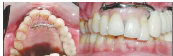
FIGURE 3: Implant-retained fixed partial denture was designed to have two reciprocal arms in the palatal and buccal aspects.

Prosthetic design with reciprocal arms was an innovative solution to intrude incisors by means of a fixed appliance. Another detail is palatal retainer extension design thought for maintenance of alignment.