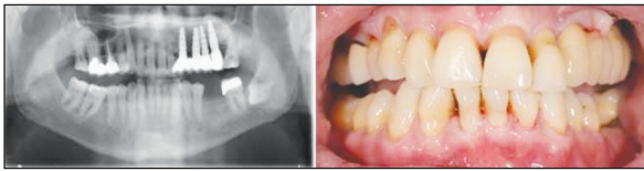
FIGURE 6: a) Peri-implant bone level maintenance in OPG taken in January 2019, b) Follow-up of the patient in January 2019.