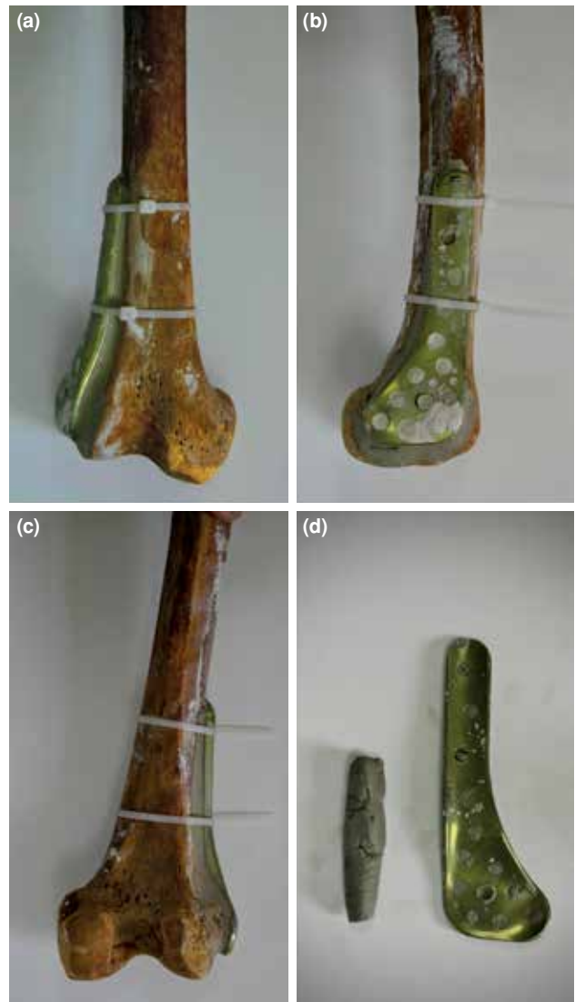
Figure 1. A five-hole Zimmer Biomet Incorporated plate placed in most fitted position as is implemented in actual surgery. (a) Anterior view. (b) Lateral view. (c) Posterior view. (d) Clay between bone and plate was scraped completely and rolled into a ball.

The mean femoral length was 43.09 \pm 3.07 cm (range, 36-52 cm) and the bicondylar breadth was 7.77 \pm 0.58 cm (range, 6.7-8.8 cm). Both had normal distribution. As expected, there were significant correlations between the lengths versus bicondylar breadths ( p=0.0001 ).