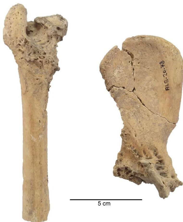
Figure 8. Example of coxal dysplasia and osteophyte proliferations in the Alaybeyi dog bones—these two specimens apparently belonged to a single individual: ( left ) femur; ( right ) os coxae.

from the Early Iron Age site Büyükardıç [18]. The Iron Age levels of Sos Höyük in Erzurum also present only very few dog bones [25,26]. Scarcity of canine remains also appeared at the Iron Age site Büyüktepe Höyük in Bayburt [26]. In contrast, domestic dogs still stand high at Alaybeyi Höyük, comprising about 9% of the total identified fauna [20].