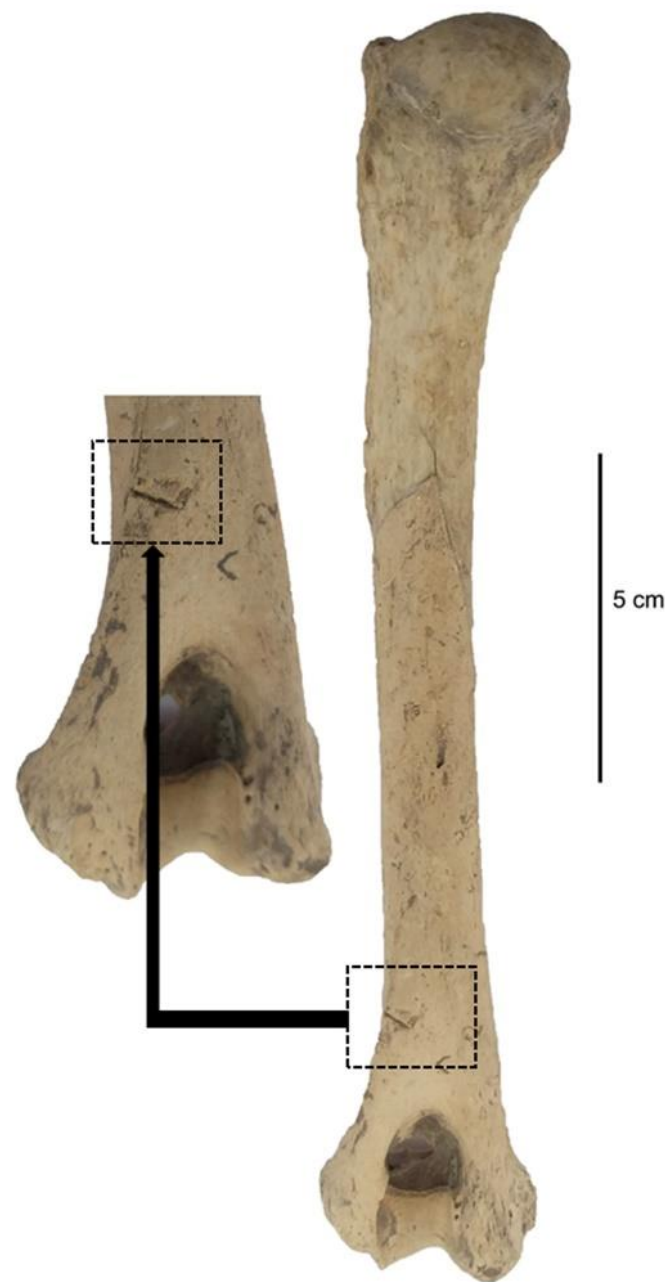
Figure 10. The left humerus of the dog “ALB No. 4” from Alaybeyi Höyük exhibits a deep cut mark.

Ethnographically, it is clear that there is a wide range of human–dog relations [45]. Together with their roles as companions, hunting assistants, or guardians of the herds [46], dogs are often raised for food, sources of meat in crisis times, specific rituals, or medicinal purposes [46–48]. Puppy sacrifice was in practice in Anatolia during the Bronze Age, and both sacrifice of the dogs and cynophagy is known from Iron Age Eastern Mediterranean [21,40,49–51]. Particularly, dog remains found in cooking pots from the Iron Age stratum of the Sardis on the Aegean coast of Western Anatolia were interpreted as sacrificial meals [51]. Dog bones with cut marks from the Early–Middle Iron Age stratum of Tel Miqne-Ekron in Palestine [49] and Ashkelon in Israel [50] were also described as evidence of cynophagy, sacrificial use, and the sacred status of dogs. At Alaybeyi Höyük, the distribution of dog bones was often associated with ungulate bones deposited as food residues, indicating that dog bones too might have a similar function. Although cynophagy was not noticed at other neighboring Iron Age sites, it appears that the practice of eating dog meat was present at Alaybeyi Höyük, if not a regular diet, at least for a special occasion.