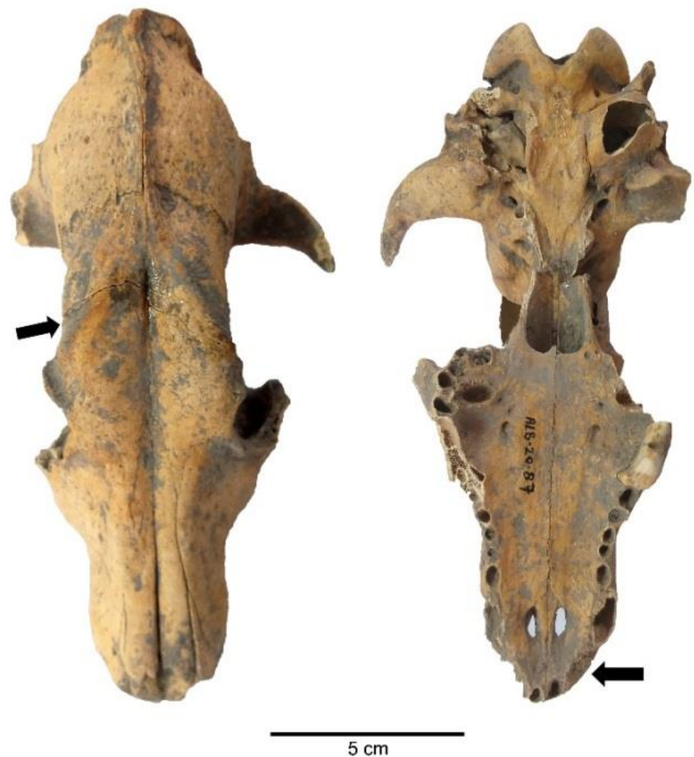
Figure 7. A dog skull from Alaybeyi Höyük with a healing fracture (left arrow) and oligodontia (right arrow).