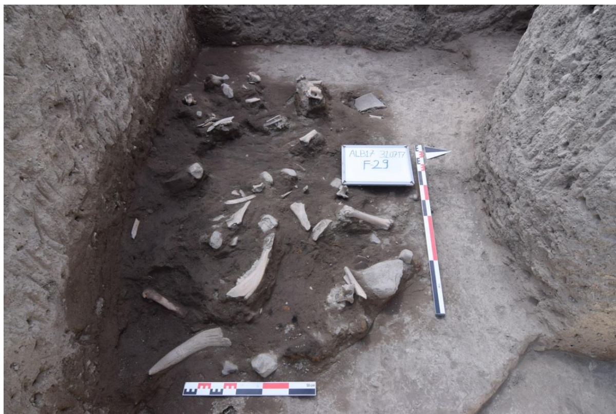
Figure 3. A large composition of animal bones with hearth fragments unearthed at the western section of Alaybeyi Höyük.