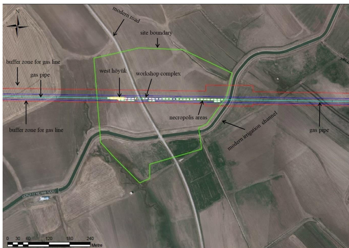
Figure 2. Topography and excavated areas of Alaybeyi Höyük: the modern road divided the site in east and west sections.

of 143 specimens—accessible for morphometric analysis—were taken into consideration for this detailed zooarchaeological study.