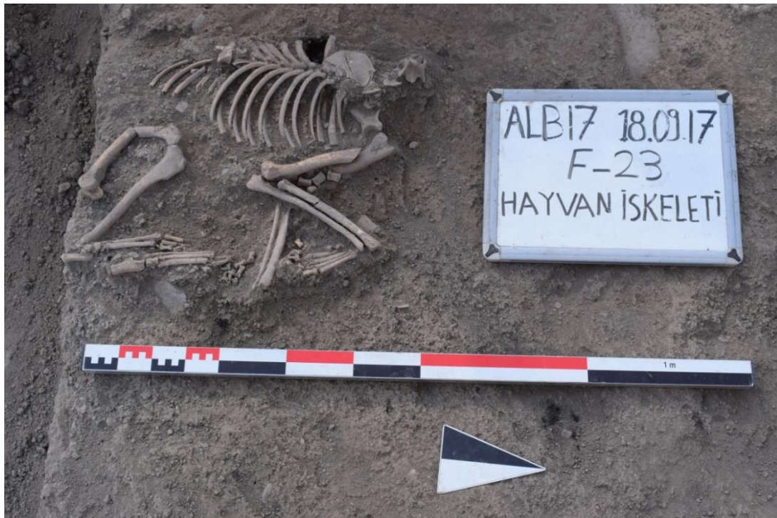
Figure 5. An in situ dog burial (ALB No. 1) unearthed from the empty space in the middle of the Iron Age workshop complex at Alaybeyi Höyük.

Besides the two dog burials, other canid remains, including skulls, mandibles, humerus, pelvis, sacrum, and tibia, were found scattered in the workshop and courtyard complex (Table 2). Among them, one skull appeared to be the skull of the dog buried without its head.