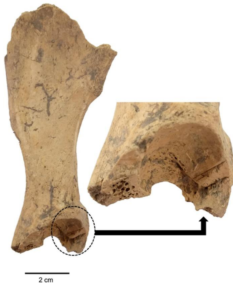
Figure 9. Cut and chop marks in the right coxal bone of an Alaybeyi dog.