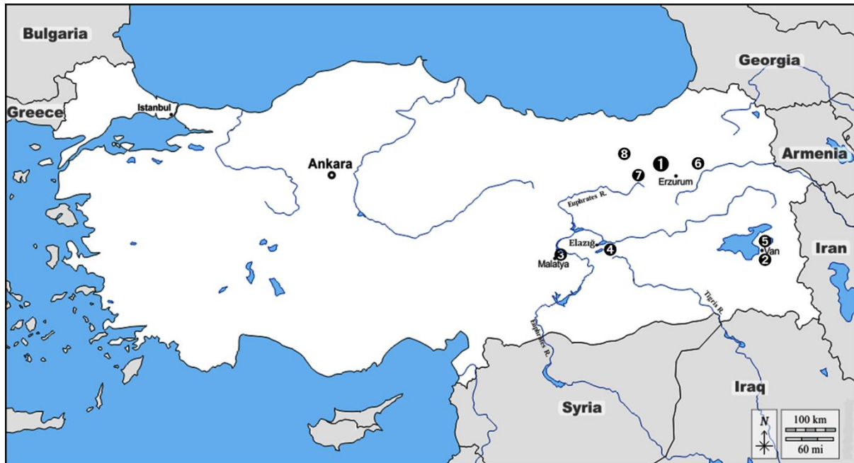
Figure 1. Location of the Eastern Anatolian Bronze Age–Iron Age sites mentioned in the text: 1. Alaybeyi Hoyuk; 2. Yoncatepe; 3. Arslantepe; 4. Iron Age sites under Keban Project; 5. Altıntepe; 6. Sos Höyük; 7. Büyükardıç; and 8. Büyüktepe Höyük (map by A.B. Siddiq).

remains, evidence of extensive production activities, and rich numbers of burials at the large necropolis [29] clearly indicated that Alaybeyi Höyük was a big and important settlement in the region.