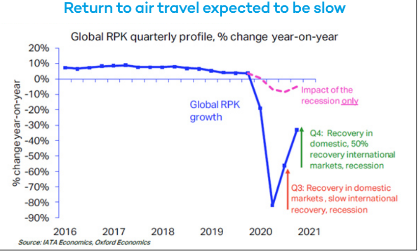
Figure 1. Air Travel Expectation in 2020 and 2021 (IATA, 2020)