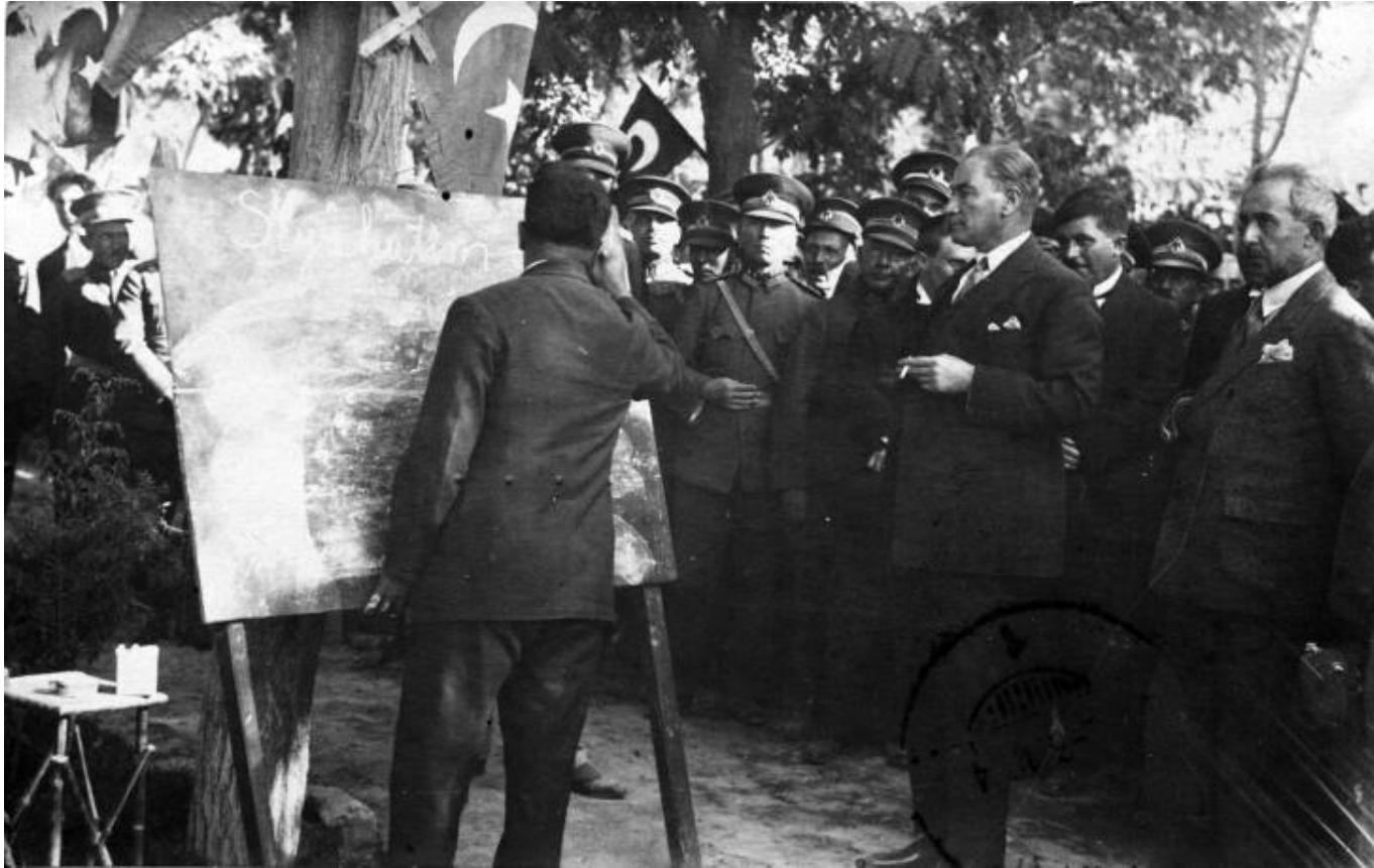
Head teacher Mustafa Kemal is teaching the new alphabet in Sivas in 1928.