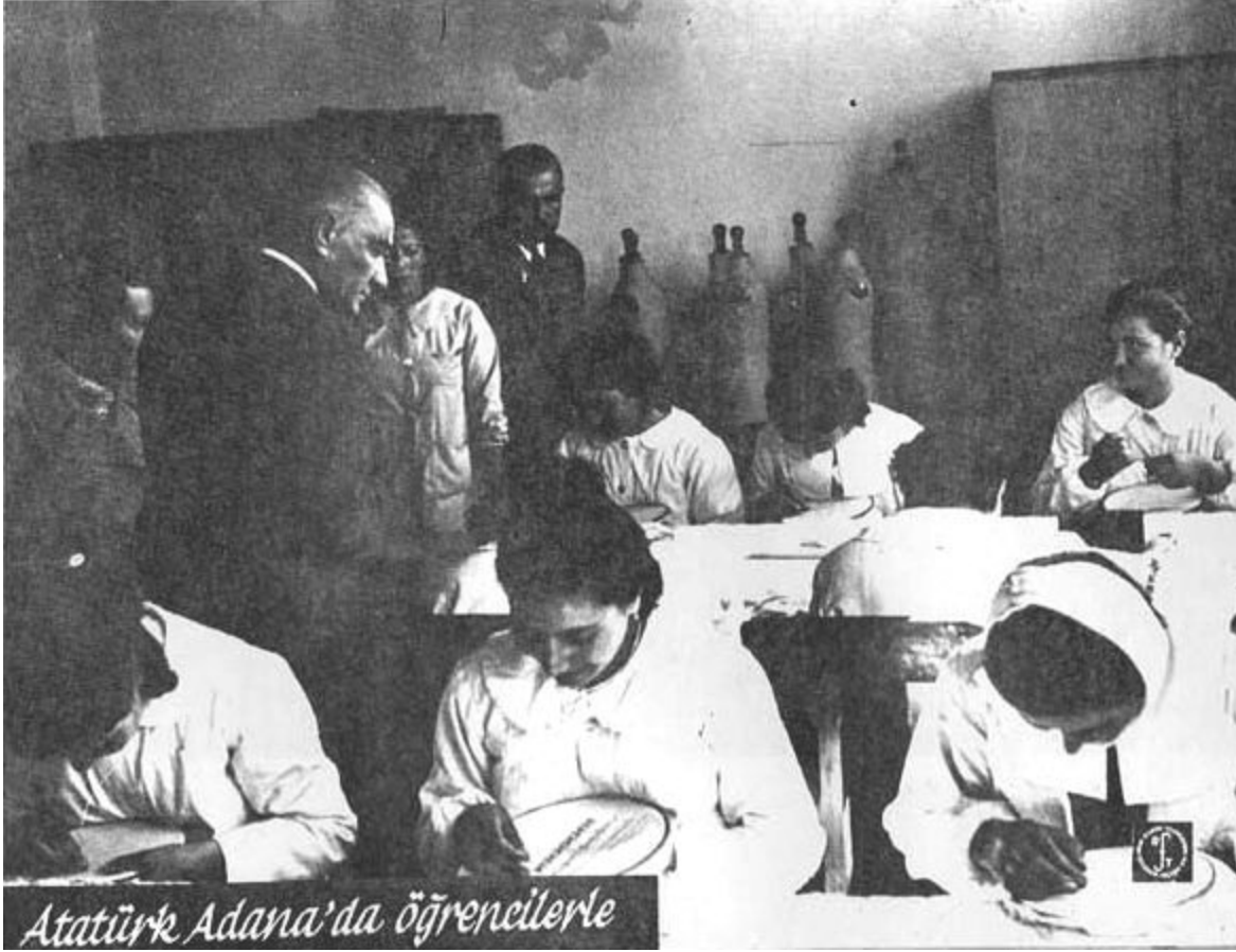
Ataturk with students in Adana