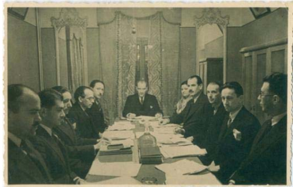
Meeting of the Turkish Language Association, 1933.