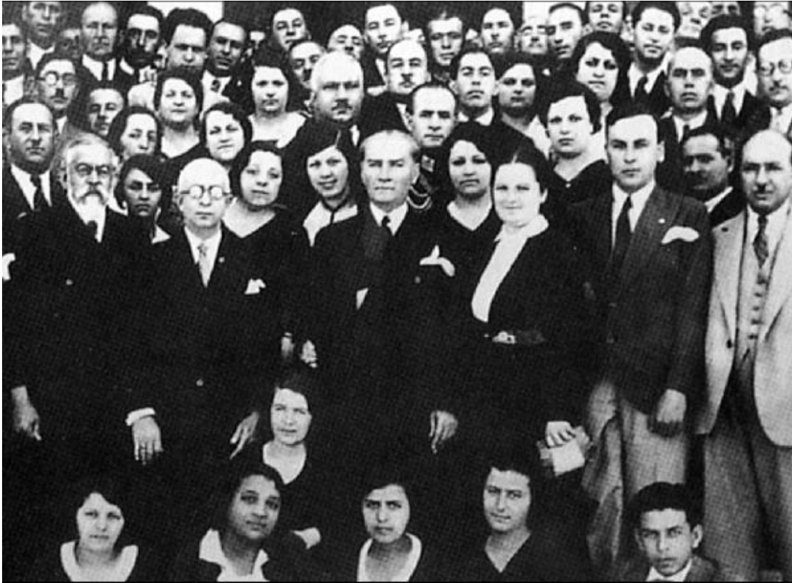
Establishment ceremony of the Turkish History Institution in 1931.