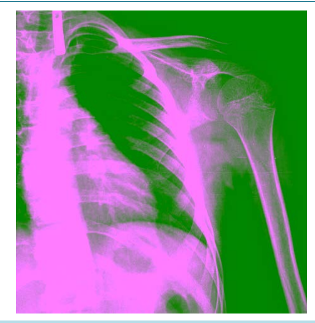
Figure 3. Anteroposterior roentgenograph of case 2. Fracture clear image in this roentgenograph is not available.