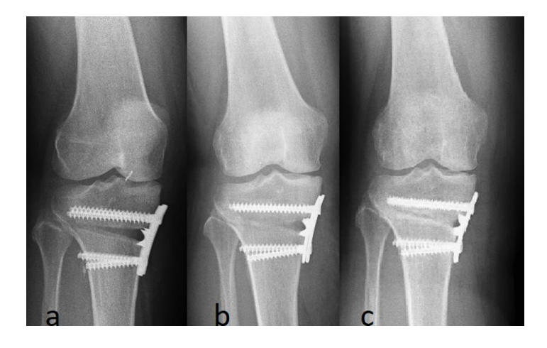
Figure 3. anteroposterior right knee roentgenograms of 46 years old women in the control group, a; immediate postoperative, b; postoperative third month, c; postoperative first year.

at anteroposterior and lateral radiographs and was ensured by decreasing pain and regaining of functions. (Figure 3 and Figure 4 demonstrate the postoperative follow up radiographs of the patients treated by the two techniques)