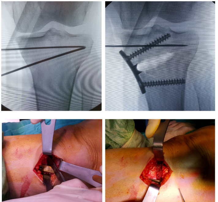
Figure 2. a; osteotomy is performed with the guidance of these K-wires, b; osteotomy gap is left unfilled in the control group, c; one curved osteotome is used for separation of the metaphyseal cancellous bone from the distal tibial fragment at 40-45^{\circ} to the horizontal plane, d; cancellous bone is slid into the osteotomy gap in graft sliding group

gap was not filled in. (Figure 2b) Then first a 12 mm plate was placed medially followed by a second plate (9, 10, or 11 mm) was placed anteromedially and with care to evade a potential increase in the tibial posterior slope. In the metaphyseal bone sliding technique, a distal screw of 12 mm plate was placed unicortically as we aimed to allow the distal tibial metaphyseal bone to slide in effortlessly. We used one curved osteotome to separate the metaphyseal cancellous bone from the distal tibial fragment at 40-45° to the horizontal plane (Figure 2c). Next, this cancellous bone was slid into the osteotomy gap by turning it on a lateral pivot point (Figure 2d). Then the second plate placed just as in the same with the control group and unicortical screw was changed with a bicortical one. All patients were applied hemovac drain.