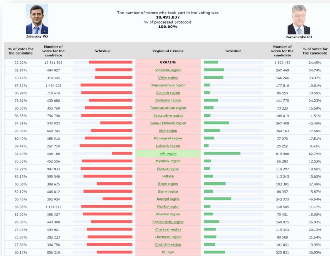
Table 6: Zelensky versus Poroshenko, preliminary vote according to the regions (31 March, 2019). (Central Electoral Commission, 2019c)

Compared to figure of 2004, absolute majority and almost univocal regional preferences seem to disappear. As it can be seen from the figures, the highest number did not even pass the 50%. Even in foreign constituency Poroshenko’s performance deteriorated from 62.31% in 2014 to 54.73% in 2019 run-off. Poroshenko has a support of the Ukrainian diaspora in the US, he has also established close relations with diaspora in Turkey, particularly during the negotiations with Fener about independent Ukrainian church. Yuliya Tymoshenko has almost equal support in the Western and Central regions (approximately 17%), but traditionally very low performance in the South (9.6%) and the East (7.4%).