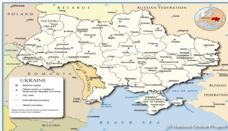
Map 1: Administrative division of Ukraine