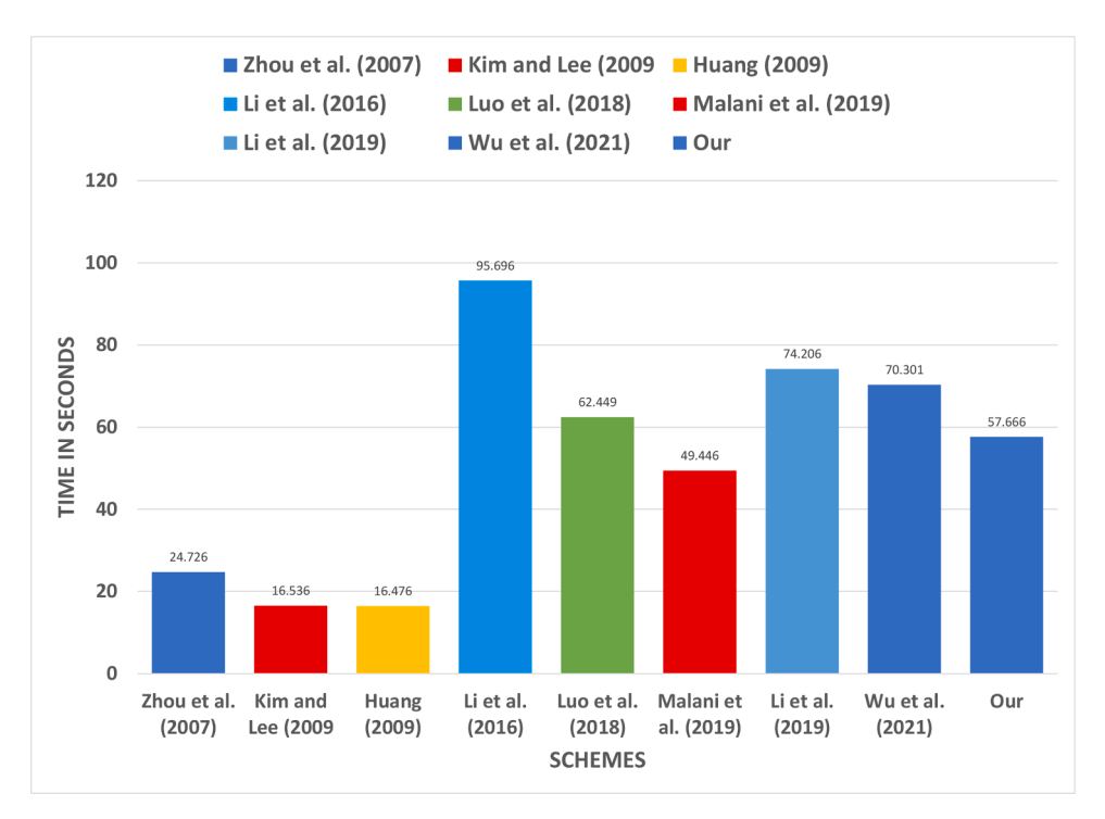
Fig. 3. Computation Cost Comparisons.