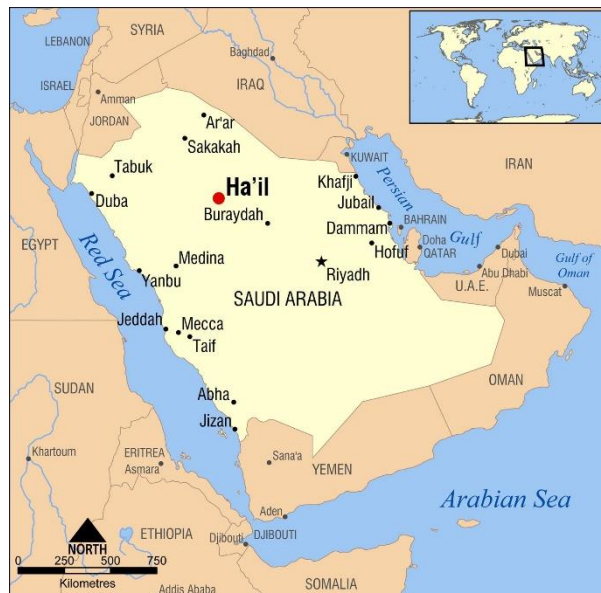
Fig. 6: The Kingdom has 13 regions among which Hail is divided into four administrative provinces

Visual pollution differs from one region to another and from one city to another, and the Ministry of Municipal and Rural Affairs is focusing on it, as it is the authority concerned with reforming what has been happening as a result of the visual pollution in the Kingdom, and the urban landscape program is the basis for removing visual pollution defined in 30 manifestations.