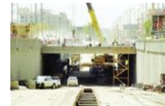
Fig. 22: Concrete bridges and the visual obstruction and distortion they cause to the surrounding areas