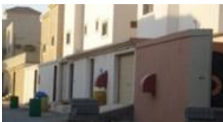
Fig. 2: Municipality Health Authority Waste plastic containers in front of houses