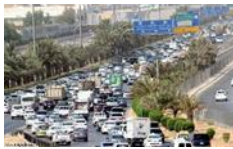
Fig. 16: The congestion of road networks