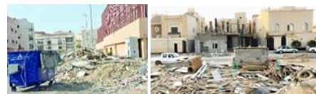
Fig. 20: Construction and restoration of buildings inside neighborhoods

In addition to the continuous construction and restoration of buildings inside neighborhoods and the resulting waste (Fig. 20), poor coordination in the implementation of public service projects (Fig. 21), in addition to concrete bridges and the visual obstruction and distortion they cause to the surrounding areas (Fig. 22), and the spread of concrete castings and excavations in the roads and streets of cities as a result of the continuous implementation of public service projects in neighborhoods and main roads, and their construction waste (Fig. 23), and the continuous demolition in vacant lands and neighborhood streets inside cities, in valleys and torrents, and open places outside cities (Fig. 24) and lastly the spread of advertising and commercial boards randomly (Fig. 25).