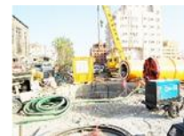
Fig. 23: The spread of concrete castings and excavations in the roads and streets of cities