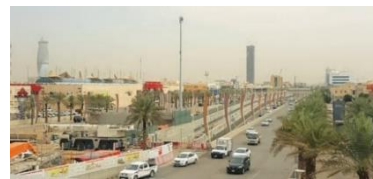
Fig. 7: Poor urban planning

Building Side facades according to Knaack et al. (2014) are generally referred to as exteriors, frontages, or faces of the building's sides, usually the front or the one mainly seen by passersby. The list determined by the Ministry of visual pollution in cities in the Kingdom included 30 manifestations, most notably poor urban planning, Fig. 7 diversified land uses within cities ( Fig. 8 ), the dissonance of building facades and their colors ( Fig. 9 ), different cladding materials, and non-homogeneous architectural styles ( Fig. 10 ).