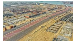
Fig. 8: Diversified uses land within cities