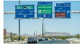
Fig. 5: The Jubail Municipality Health Authority where billboards were removed