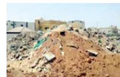
Fig. 24: The continuous demolition in vacant lands and neighborhood streets inside cities