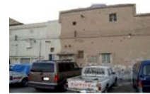
Fig. 9: Dissonance of building facades and their colors