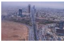
Fig. 14: Building's proportionality elements, afforestation, urban spaces