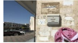
Fig. 4: Reckless placing of stickers on walls and street poles at Assir region