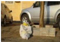
Fig. 1: Waste disposed of nearby a tree box in front of residences

Visual pollution is an aesthetic issue referring to the impacts of pollution that impair one's ability to appreciate a pleasant view. It causes destruction in the visual environment surrounding people by disturbing their surrounding sceneries. Disposing of the various waste types as well as the reckless placing of stickers on walls and street poles in addition to the random placing of antennas and overhead electric power wires has a negative physiological impact on humans' modes. According to Nagle (2009), nowadays cell phone towers have worsened the situation. People and vehicles overcrowd in an area cause visual pollution. Visual pollution is defined as the whole of irregular formations mostly found in nature. Effects of exposure to visual pollution include distraction, eye fatigue, decreases in opinion diversity, and loss of identity. It has also been shown to increase biological stress responses and impair balance as Yilmaz and Sagsöz (2011) affirmed. Based on Yilmaz and Sagsöz's (2011) studies; it is more serious in historic cities as silhouettes, the faces of the physical structure, and historical accumulation of cities, add to the visual pollution negative impact.