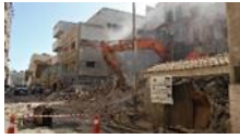
Fig. 11: Many defects in construction