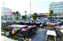
Fig. 18: The indiscriminating spread of vending cars and street vendors on sidewalks and city streets