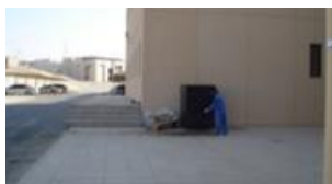
Fig. 3: Chemical reactions of disposed of liquids in front of buildings