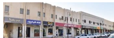
Fig. 10: Non-homogeneous architectural styles

In addition to the many defects in construction ( Fig. 11 ) leaving the side façades in some buildings on the main roads without external cladding or plaster ( Fig. 12 ), and the heights of buildings dissonant with each other ( Fig. 13 ), their irregularity and proportionality with the surrounding urban spaces ( Fig. 14 ), the lack of urban spaces within cities to the aesthetic elements, afforestation, and landscape elements ( Fig. 15 ).