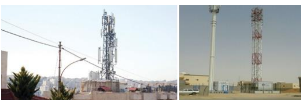
Fig. 19: The communication towers on the roofs of buildings and in the vacant lands of public facilities

In addition to the continuous construction and restoration of buildings inside neighborhoods and the resulting waste (Fig. 20), poor coordination in the implementation of public service projects (Fig. 21), in addition to concrete bridges and the visual obstruction and distortion they cause to the surrounding areas (Fig. 22), and the spread of concrete castings and excavations in the roads and streets of cities as a result of the continuous implementation of public service projects in neighborhoods and main roads, and their construction waste (Fig. 23), and the continuous demolition in vacant lands and neighborhood streets inside cities, in valleys and torrents, and open places outside cities (Fig. 24) and lastly the spread of advertising and commercial boards randomly (Fig. 25).