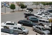
Fig. 17: The random in the parking of squares cars the streets and squares