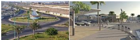
Fig. 15: Lack of urban spaces irregularity and within cities to the aesthetic with the surrounding and landscape elements