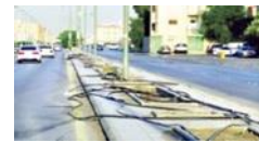
Fig. 21: Poor coordination in the implementation of public service projects