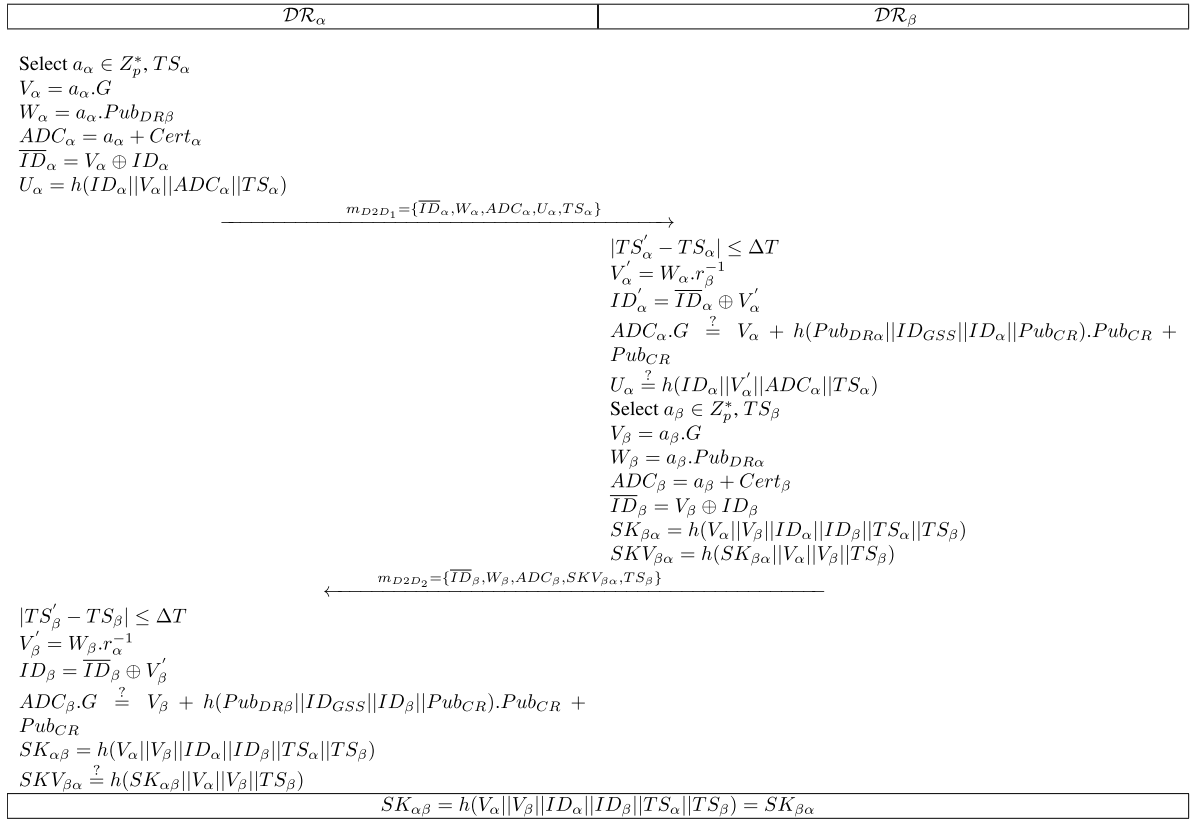
Fig. 3. Proposed procedure.

The improved scheme's ( GCACS - IoD ) semantic security is given in Definition 1 before proving Theorem 1.