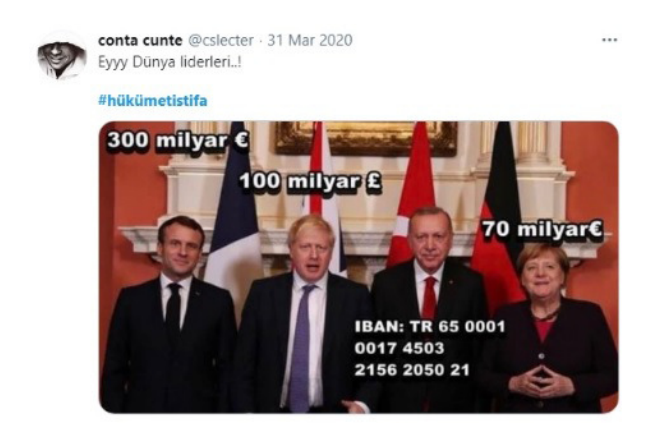
Figure 3. Humorous reaction for measures taken in Turkey against pandemic. Source: conta cunte (2020).

In Figure 3, President Erdogan is criticized within the framework of his economic action plan in the pandemic—a campaign called Together We Are Enough My Turkey. In the study, it can be said that the people or groups producing counter-discourse conduct partially a troll-politics strategy. In particular, counter-troll-politics stand out on issues such as "government resign," which are likely to be politicized and polarized rather than issues that concern the whole society and are sensitive, such as "censorship law" and "child abuse."