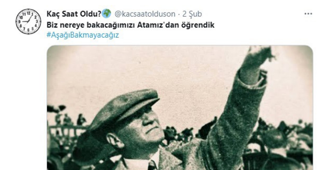
Figure 4. Counter-trolls often refer to Atatürk in quarrels. Note: "We learned where to look from our Father" (translation by the author).

Figure 5, indicating that Boğaziçi University students are against any ban, shows that the group described