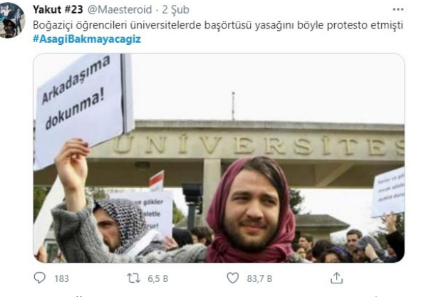
Figure 5. Boğaziçi students protested the headscarf ban in universities.