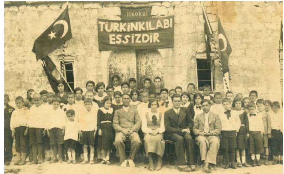
Banner says: «Turkish Revolution is unique»