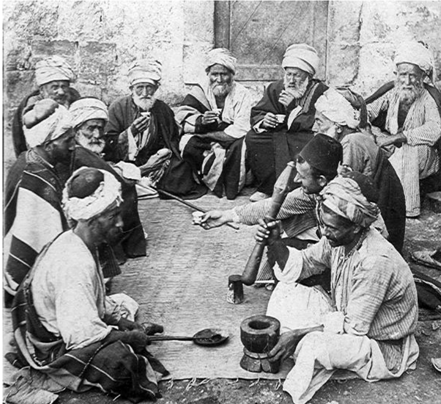
A coffeehouse discussion in the Ottoman Empire