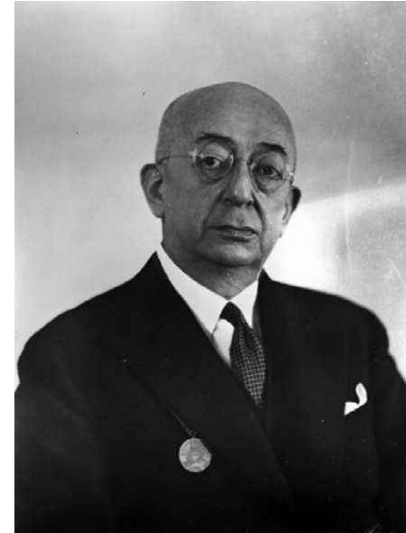
Refik Saydam Turkish Doctor and Politician, 4th Prime Minister of Turkiye