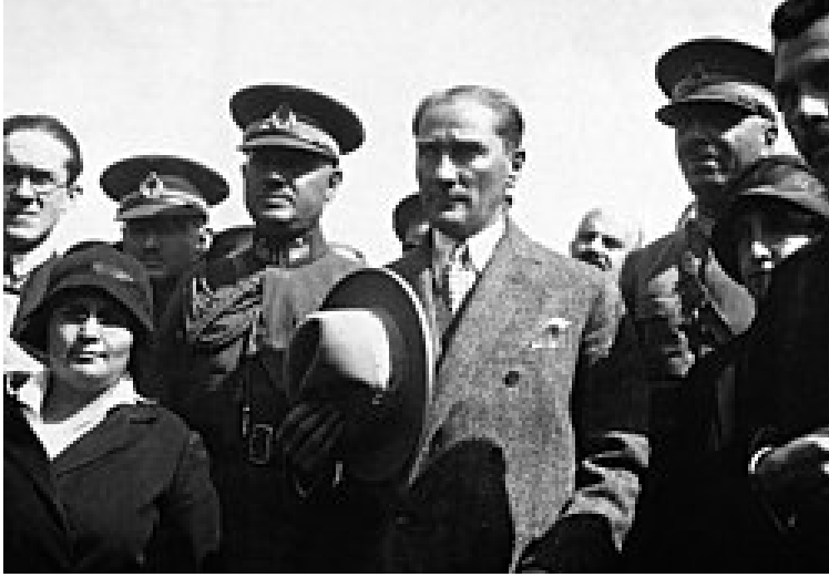
Mustafa Kemal Pasha in Izmir for the Introduction of Hat (Şapka) October 11, 1925

«Fellows, Effendies and Turkish Nation! The Republic of Turkiye can not be a homeland of the sheihks, dervishes, disciples and lunatics. The truest and the most genuine way is the way to the civilization.»