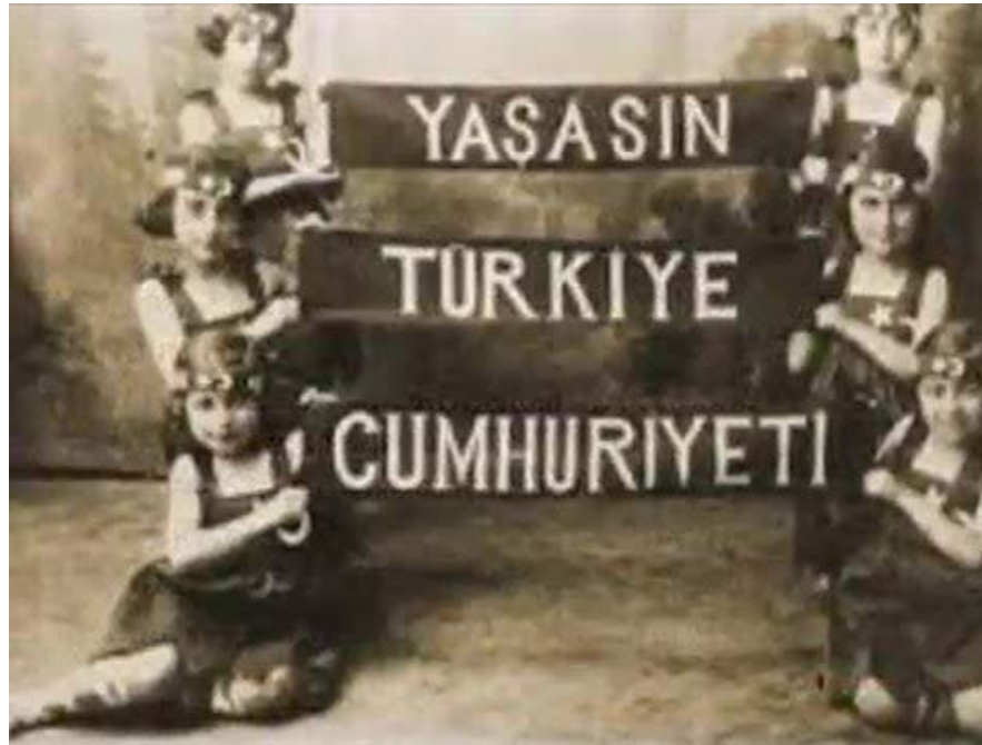
Banner Says: «Long Live the Republic of Turkiye»