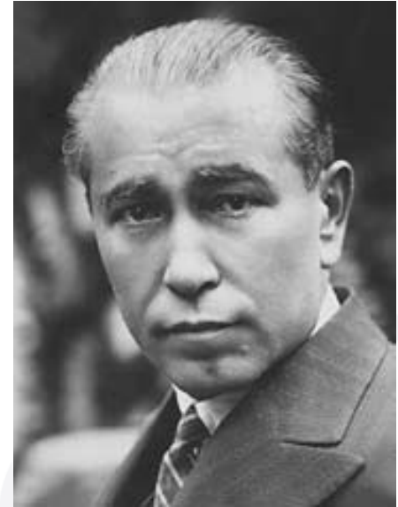
Ali Fethi Okyar was the leader of the second opposition (organized under the GNA) party