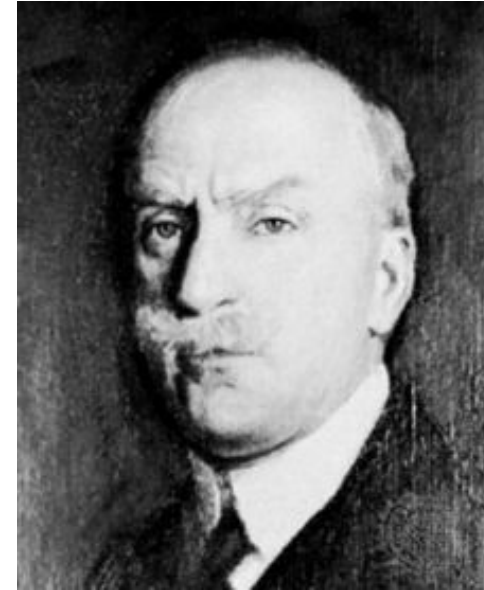
The last caliph Abdülmecid II who went into exile in 1924