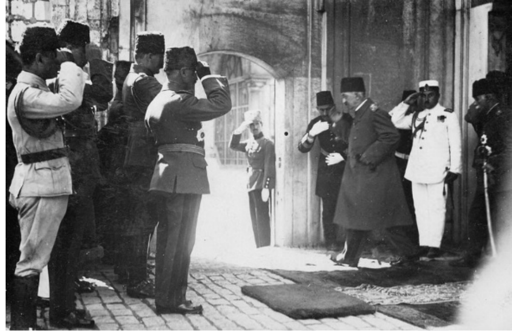
Departure of Mehmed VI from Istanbul after the abolishment of Sultanate.