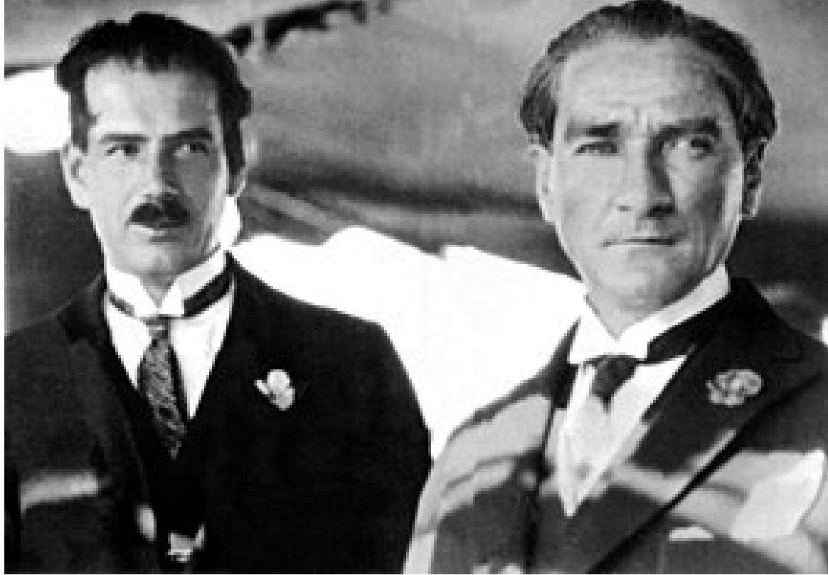
Ruşen Eşref (Ünaydın) and Mustafa Kemal (Atatürk) on the deck of Ertuğrul yacht on June 5, 1928.