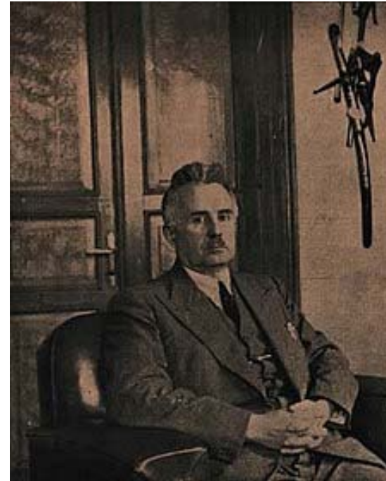
Kâzım Karabekir led the Progressive Republican Party, which was the first opposition (organized under the GNA) party.