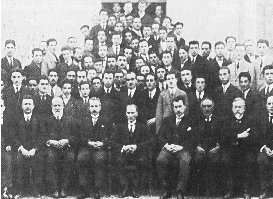
Members of the Turkish Parliament